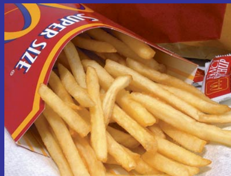
Food Production and Service